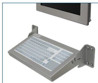
Panel Mount workstation configuration with monitor and industrial keyboard.