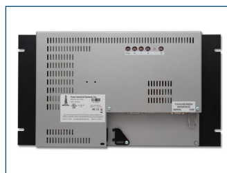
Rear view of 15" Rack Mount monitor.