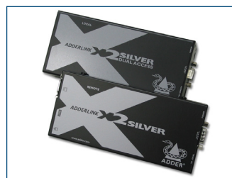
Optional KVM Extender allows monitor to be placed up to 300 m away from computer.