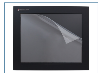
Optional Screen Protector guards touch screens from scratches and wear.