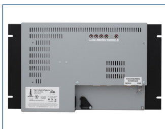
Rear view of 15" Rack Mount monitor.