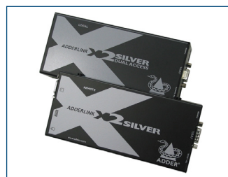
Optional KVM Extender allows monitor to be placed up to 300m away from computer.