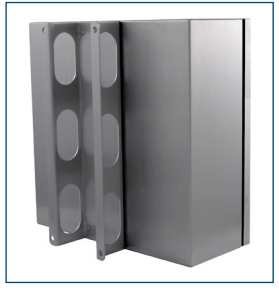
Hope Industrial Thin Client Enclosure with optional Wall Mounting Bracket.