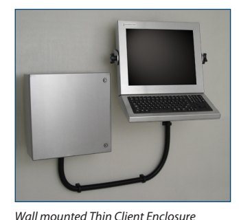
Workstation and monitor.