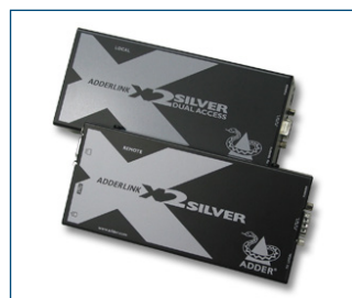
Optional KVM Extender allows monitor to be placed up to 1000' away from computer.