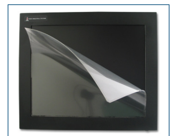
Optional Screen Protector guards touch screens from scratches and wear.