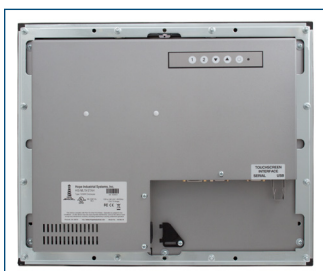
Rear view of 19" Panel Mount Monitor.