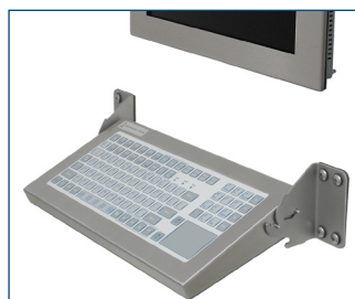
Panel Mount workstation configuration with monitor and industrial keyboard.