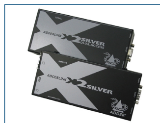
Optional KVM Extender allows monitor to be placed up to 300 m away from computer.