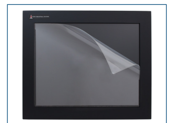
Optional Screen Protector guards touch screens from scratches and wear.