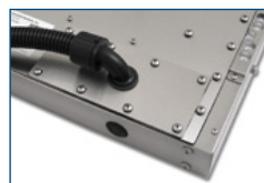
Conduit Cable Exit (IP65/IP66)