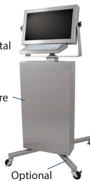
Optional Floor Stand

1m tall Pedestal, 3.2mm thick, 102mm square tube