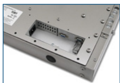
Opening to Internal Connectors