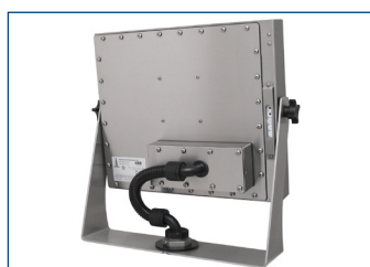
Universal Mount Monitor on Industrial Yoke Mount with KVM Extender.