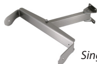
Single Extension Arm