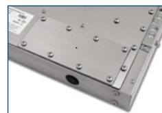
Pilot Hole Cover Plate (IP65/IP66)