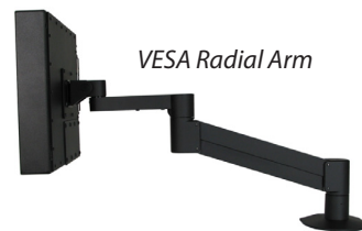
VESA Radial Arm

VESA holes allow for mounting on a Wall, Bench, Post, or Column