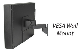
VESA Wall Mount