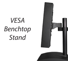
VESA Benchtop Stand