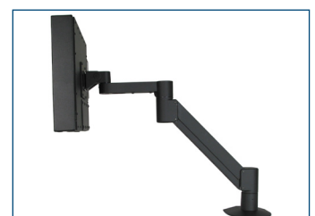
Universal Mount Monitor mounted on VESA Radial Arm.