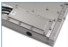
Compression Gland (IP22 or IP65/IP66)