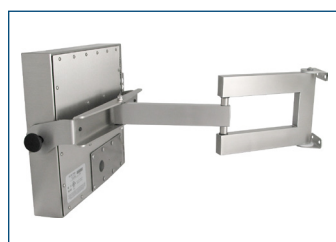
Universal Mount Monitor mounted on IP65/IP66 rated Heavy Industrial Arm Mount.