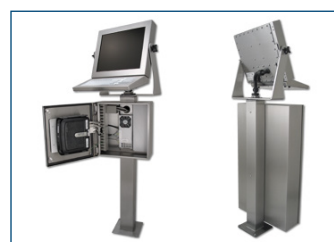
Full workstation configuration with PC enclosure, keyboard, yoke, and pedestal.