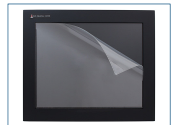
Optional Screen Protector guards touch screens from scratches and wear.