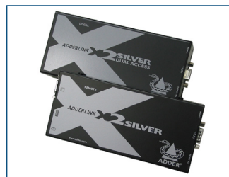
Optional KVM Extender allows monitor to be placed up to 1000' away from computer.